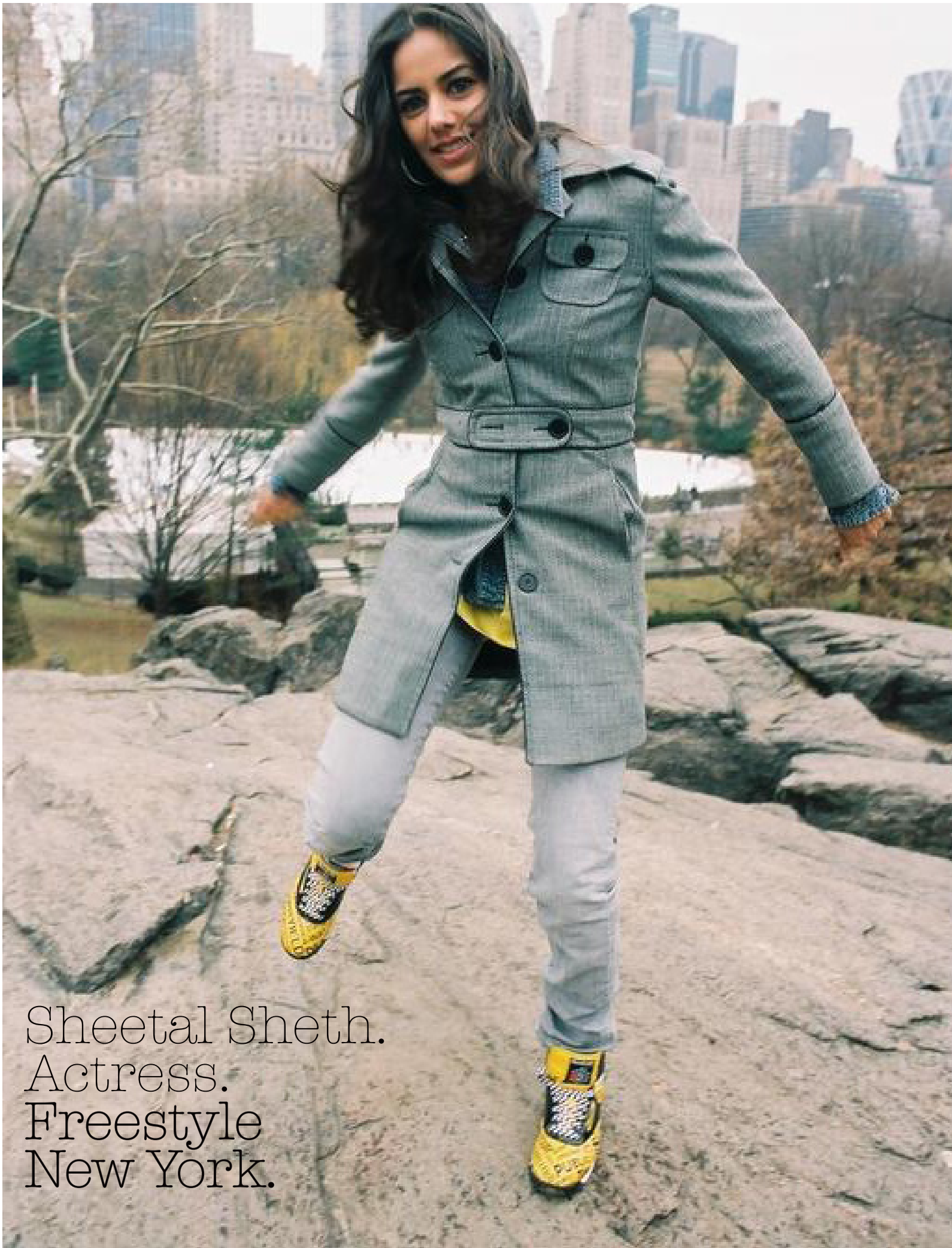
Sheetal Sheth. Actress. Freestyle New York.

Describe yourself in 5 words? Bossy, open-minded, driven, sensitive, honest.